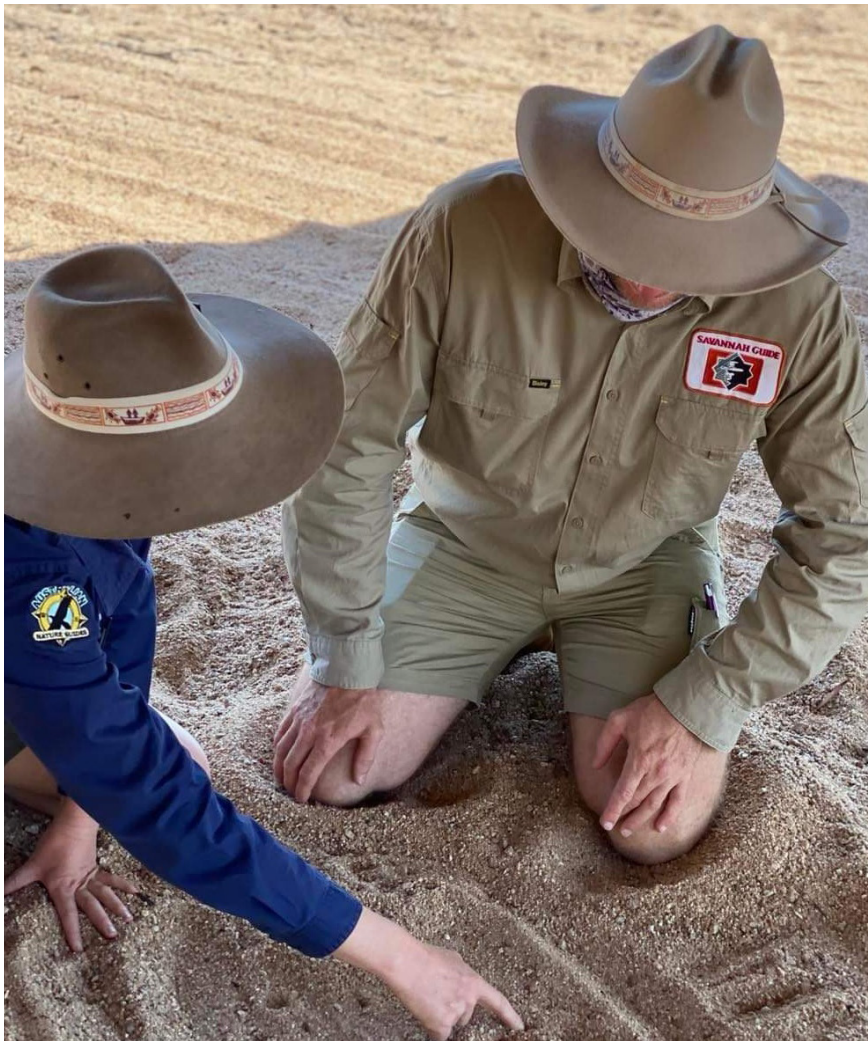
Savannah Guides discussing river systems.

A quick stop at Cumberland Chimney on our way to Georgetown, make no mistake dear readers, elbows are out and so are the binoculars. It's Twitchin' time. No quarter is taken or asked for, this is serious stuff. Our barbecue dinner at Latara Resort Motel is held inside because, you guessed it, It's HOT! After dinner a large circle gathered out the back of the Motel (yes, there was a cool breeze) for what turned out to be a mini Savannah Guides Jam Session!